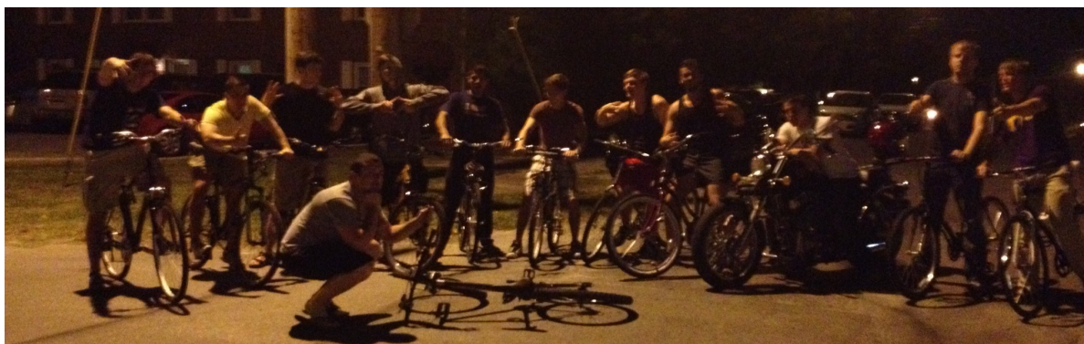
Fiji Bicycle Gang...