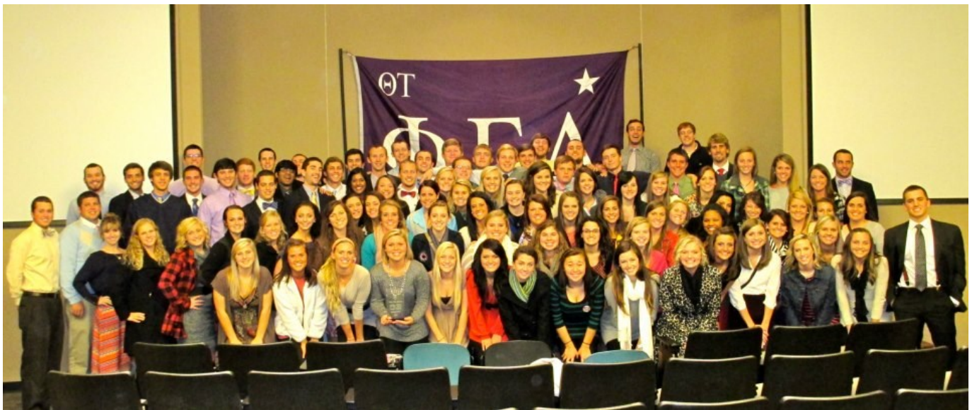
The Lovely Ladies of Kappa Delta won M.S. Island this year.